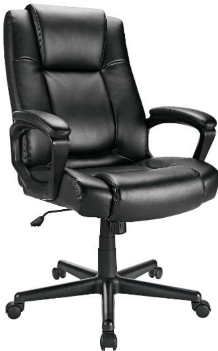
Fig 1. Office Chair (brand New)