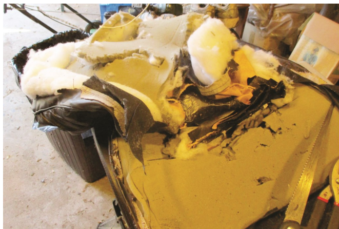
Fig 2. Initial opening of seat cushion cavity

Upon opening the seat cushion cavity two wood molded skeletal structures were extracted for closer inspection. (See Fig 3)