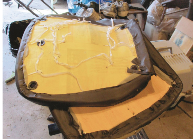
Fig 3. Two wood molded skeletal structures

It has been a while since my last alien autopsy report.