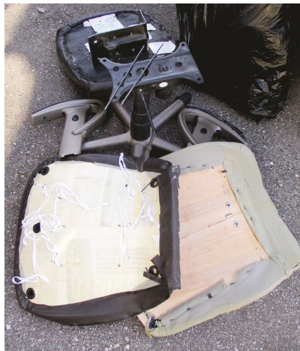
Fig 6. Dissembled Office Chair, extracted metal and residual tissue bagged up.