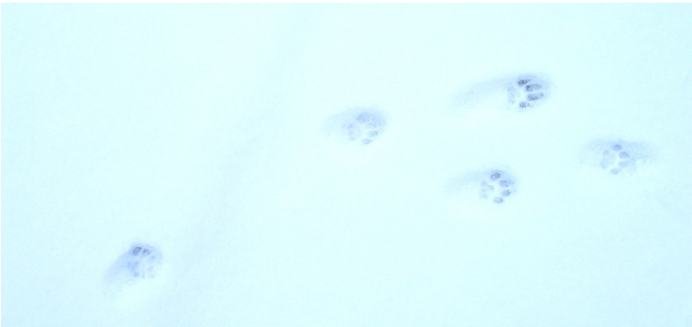
Charm snow prints