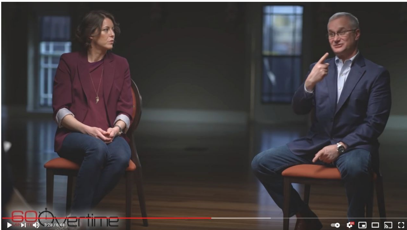
60 Minutes Overtime interviews two former Navy pilots who witnessed UAPs perform in ways that our most advanced aerospace technology is incapable of achieving.