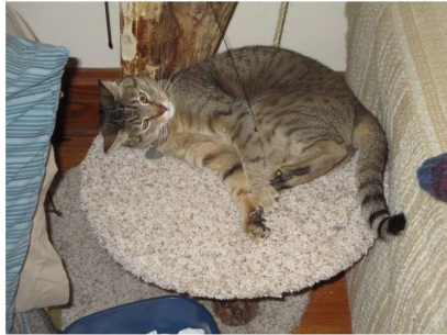
Charm's neighborhood bushmeat score card for 2020