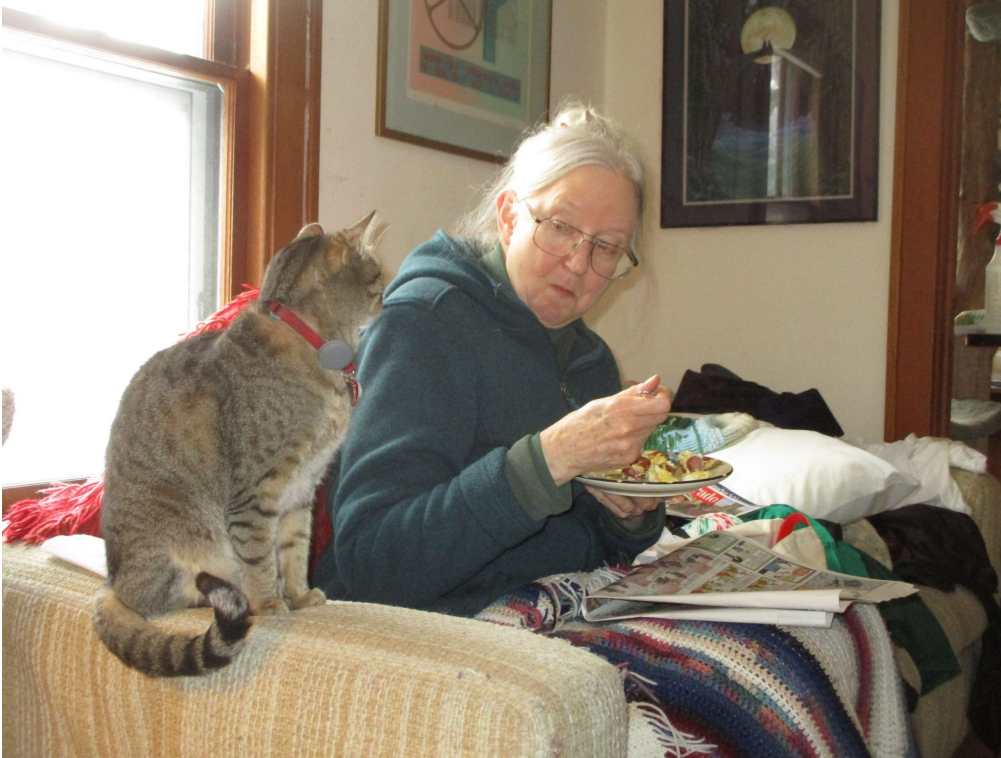
Sunday brunch. Charm holding out for second breakfast.