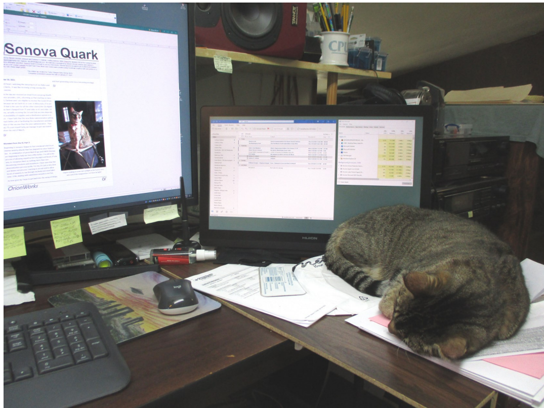
Supervising the construction of SonovaQuark #415.