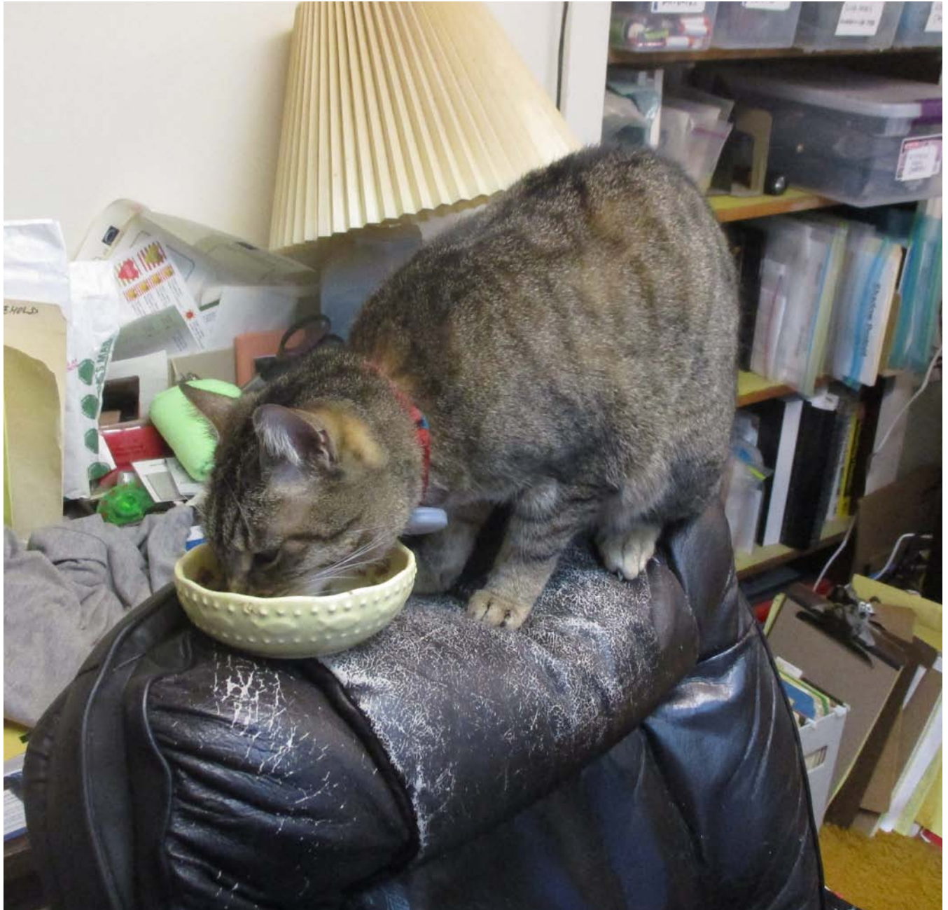
Location, location, and location.