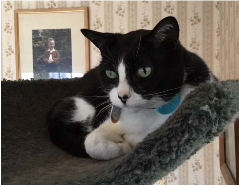
Zoey looks back at Charm.