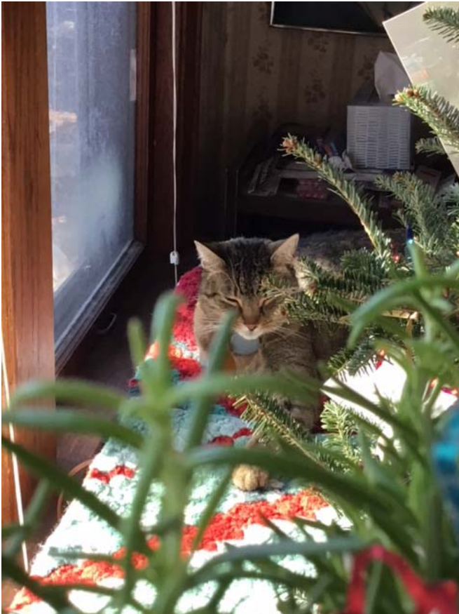
Charm is on Zoey's favorite spot in the sunshine on the table.

Some observations in the continuing facination with cat politics: