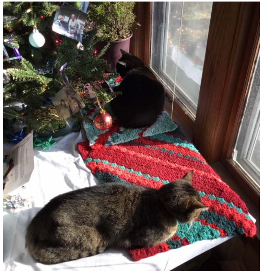
Zoey claims victory by turning her back and settling in.