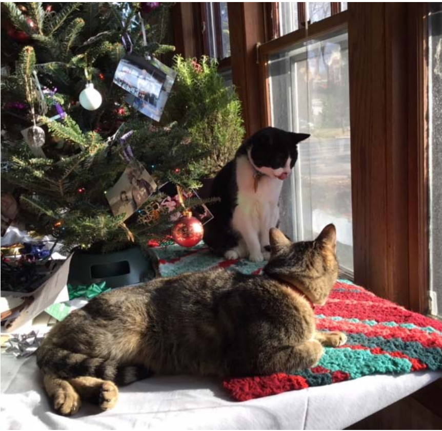
After playing 'looking/not looking' at each other for a while Zoey licks lips and they both yawn to diffuse the tension...