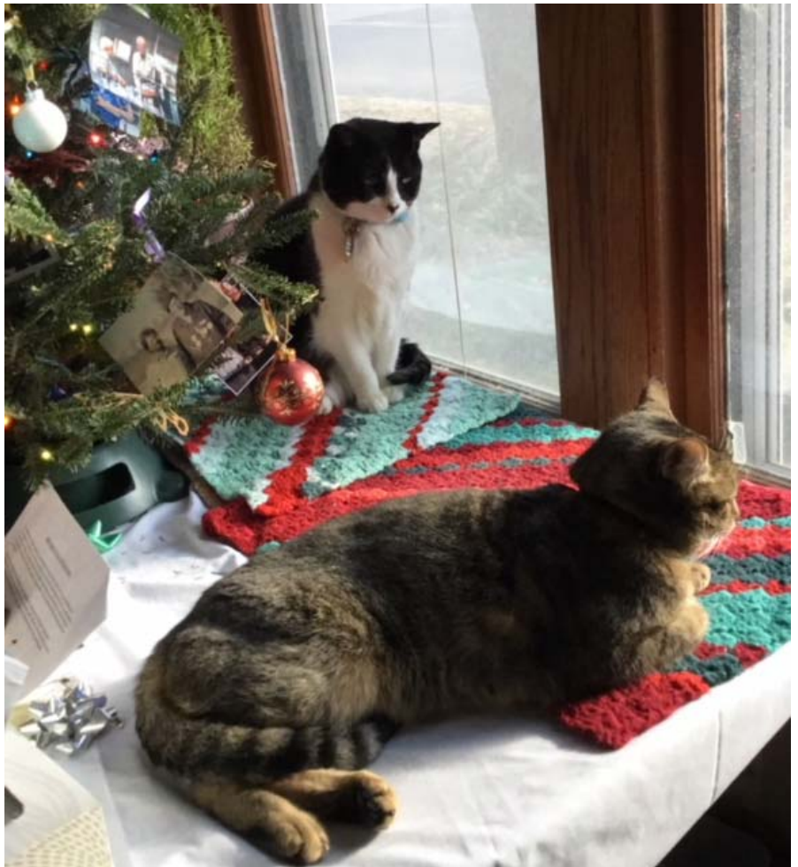
Charm goes back to the favorite spot and Zoey turns up to give her a talking to...