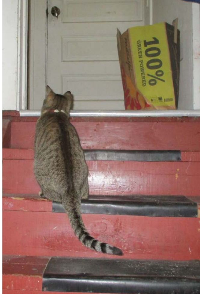
Charm waiting patiently to ambush Zoey