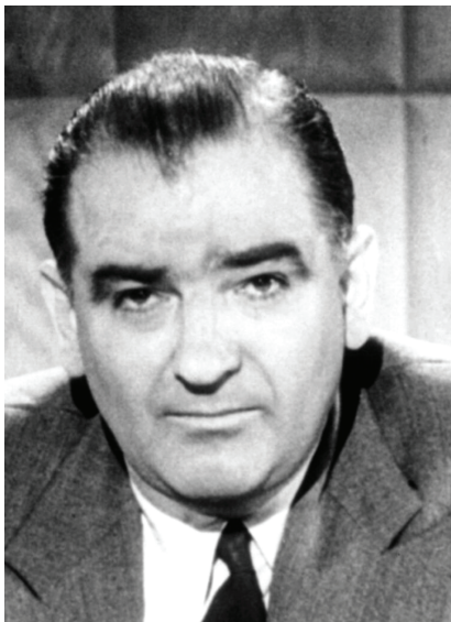
Joseph McCarthy (1908 - 1957)